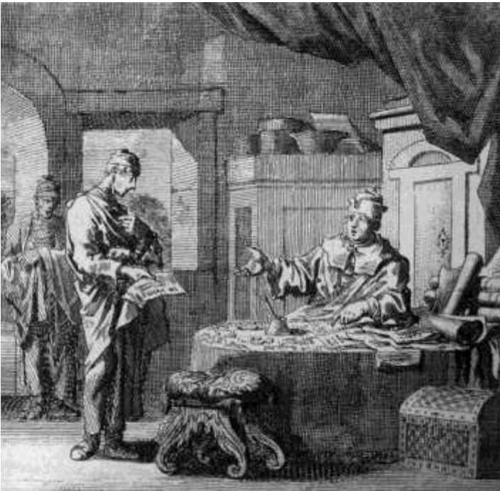
PARABLE OF THE UNJUST STEWARD. LUKE 16:1-9. [JAN LUYKEN] esculpt: harry kossuth By Phillip Medhurst - Photo by Harry Kossuth, FAL, https://commons.wikimedia.org/w/index.php?curid=7550875