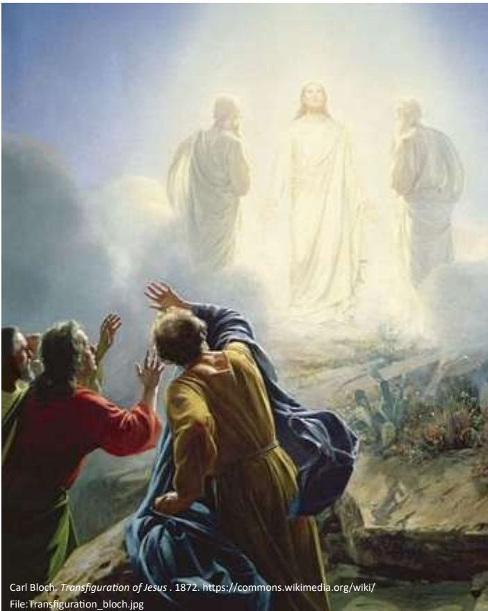
Carl Bloch, Transfiguration of Jesus . 1872. https://commons.wikimedia.org/wiki/File:Transfiguration_bloch.jpg