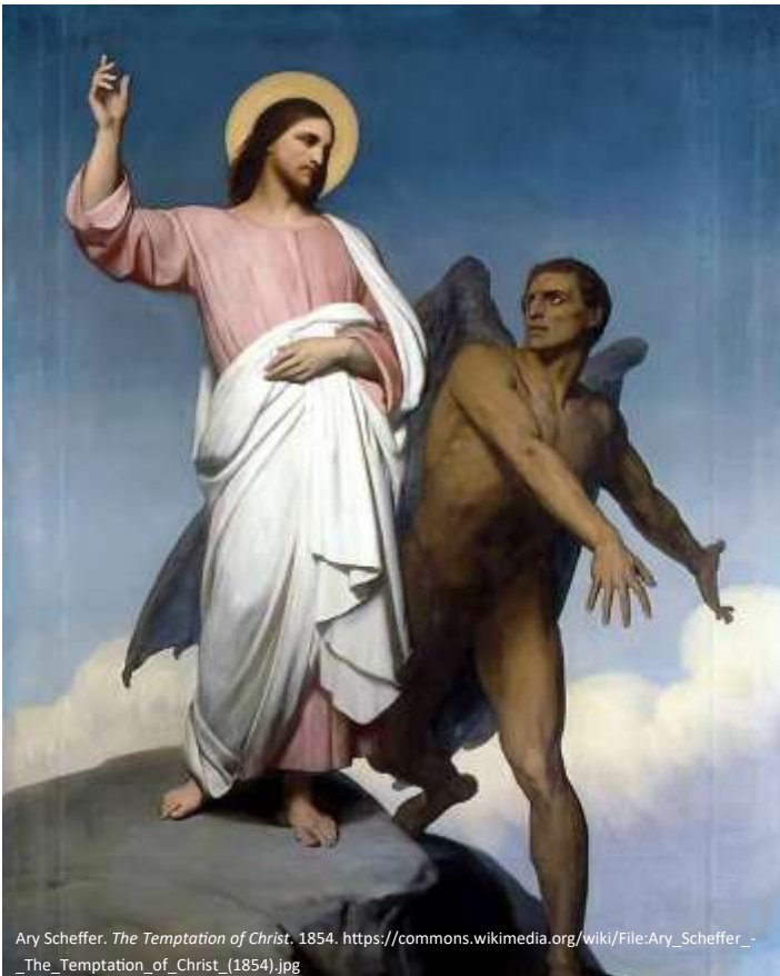
Ary Scheffer. The Temptation of Christ . 1854. https://commons.wikimedia.org/wiki/File:Ary_Scheffer_-_The_Temptation_of_Christ_(1854).jpg